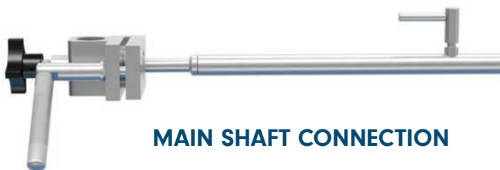
MAIN SHAFT CONNECTION