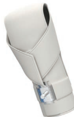
STERILE SINGLE-USE HAND MITT